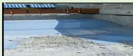
Pool Photo after repairing